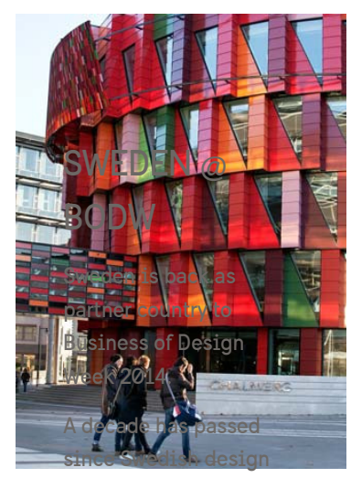
was showcased through BODW last and much has happened since.